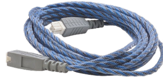
IDENTI-LEAK CABLE (5 & 10 M)