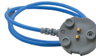
IDENTI-LEAK PROBE (1 & 3 M)